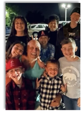
Grandkids are the Best Gift!!