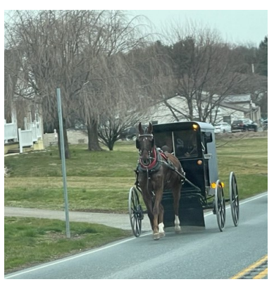
A Slower Pace in Amish Country